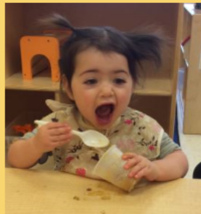
Learning to feed ourselves in Starfish! Yum!