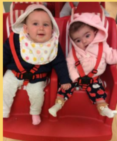
Making lifelong friends at KAH