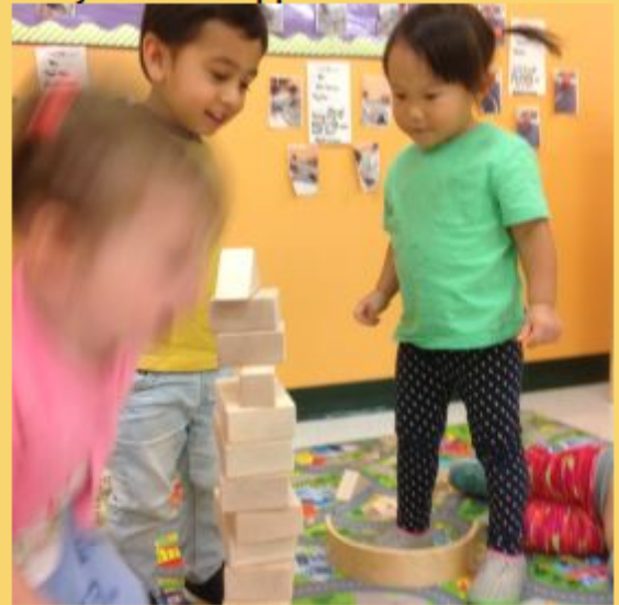
Gross and fine motor fun in Clownfish!